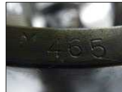
INSPECTION NO. M465