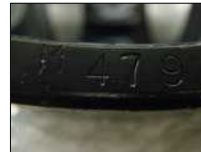
INSPECTION NO. M479