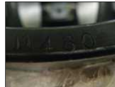
INSPECTION NO. M480