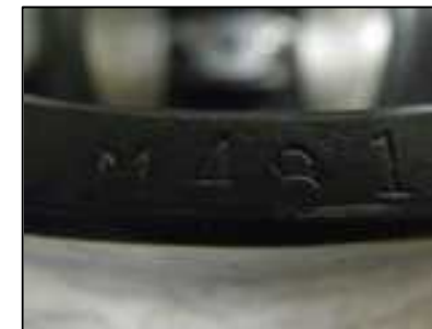
INSPECTION NO. M481