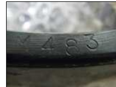
INSPECTION NO. M483