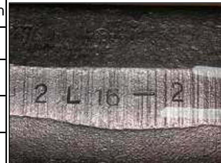
INSPECTION No. 2L16-