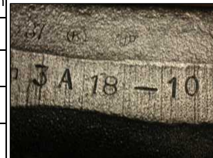
INSPECTION No. 3A18-10