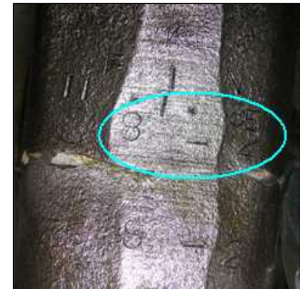
INSPECTION No. 8-2