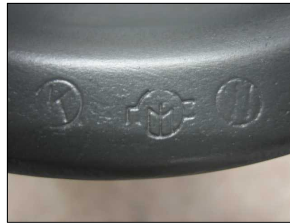
YANMAR GENUINE PARTS