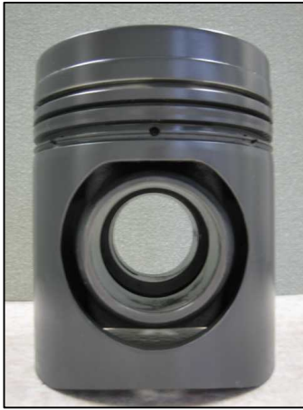
DEFRIC COATING FINISHED