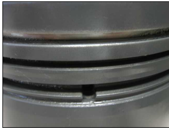
RING GROOVES FOR RECOATED