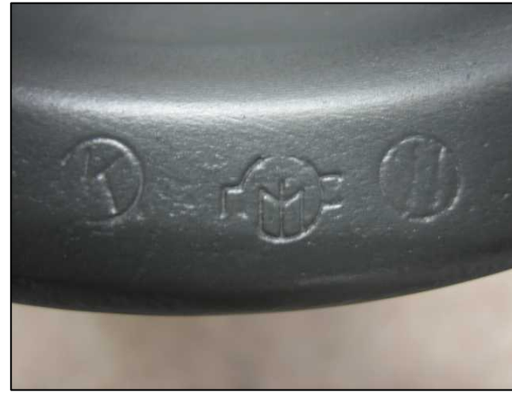
YANMAR GENUINE PARTS