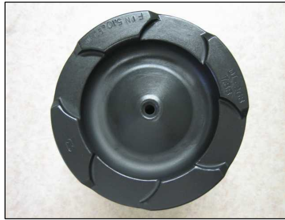
DEFRIC COATING FINISHED