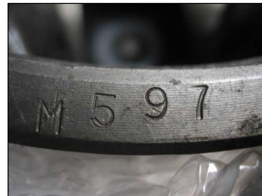
INSPECTION NO. M597