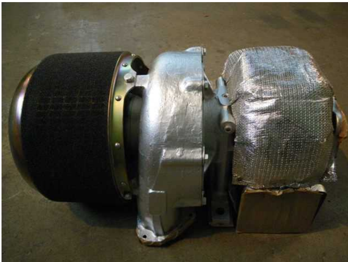
RH133-Y TURBINE ASSY 1SET